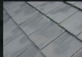
Old Flat Charcoal Gray Shake